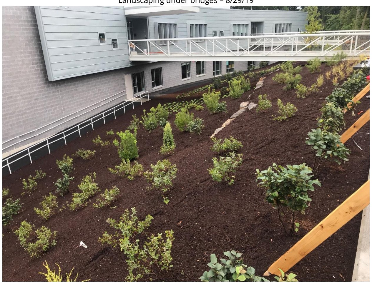
North Entrance Landscaping – 8/29/19